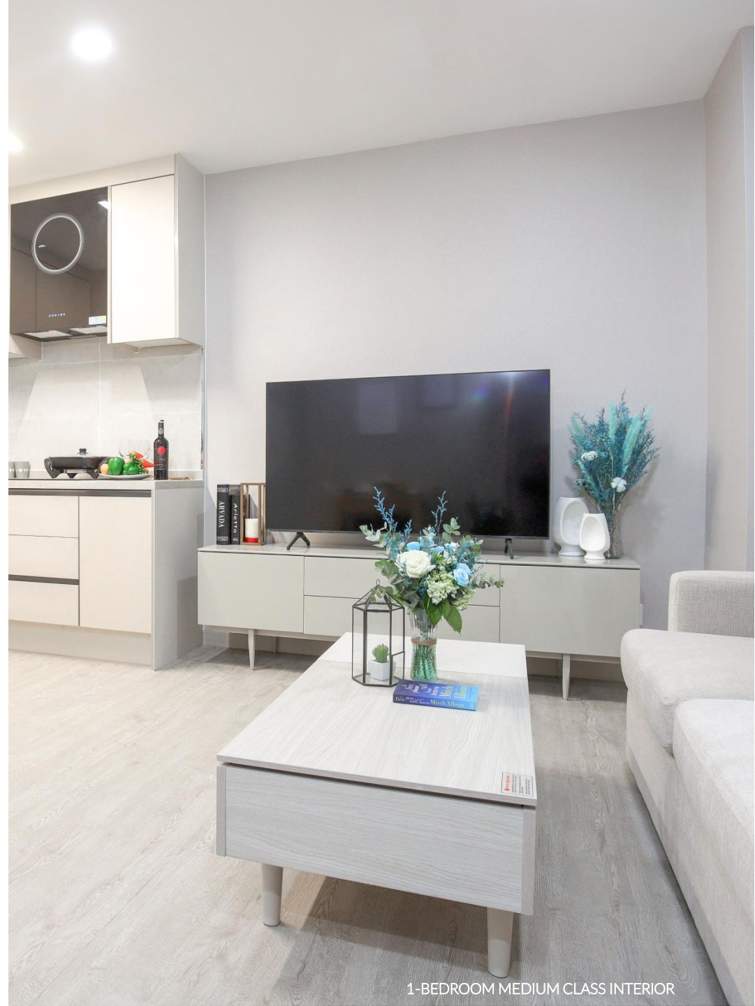
1-BEDROOM MEDIUM CLASS INTERIOR