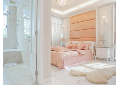
2-BEDROOM DELUXE CLASS INTERIOR