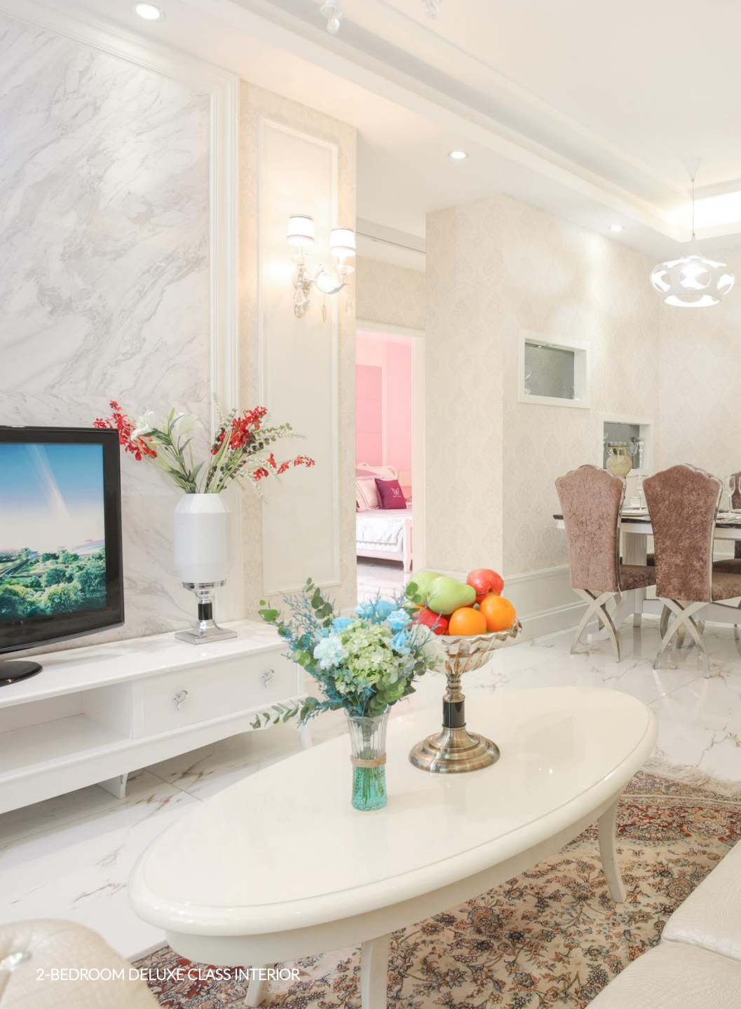
2-BEDROOM DELUXE CLASS INTERIOR