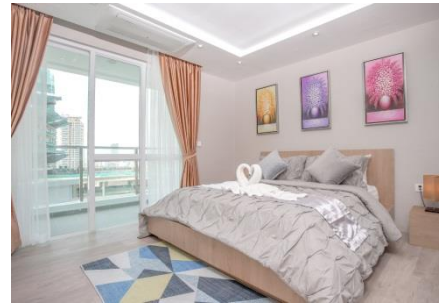
1-BEDROOM DELUXE CLASS INTERIOR