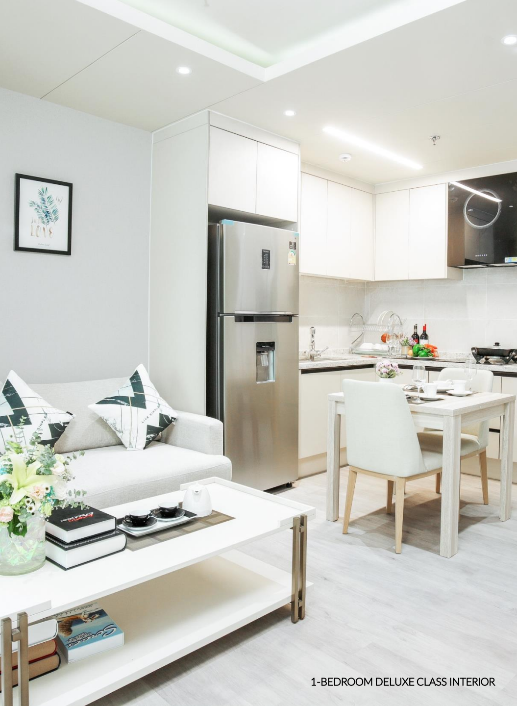
1-BEDROOM DELUXE CLASS INTERIOR